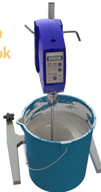
Dispersion of ceramic powders