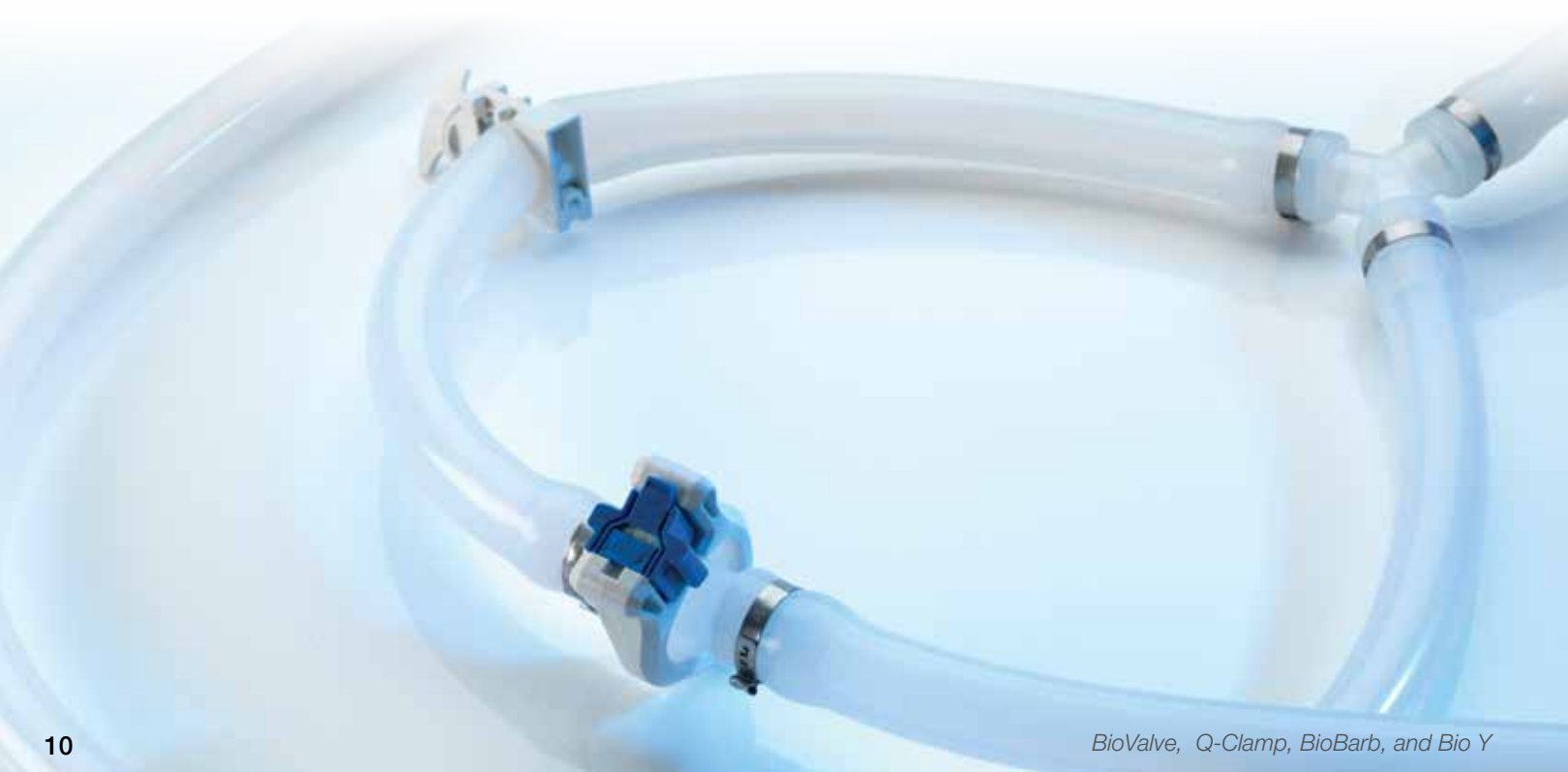
BioValve, Q-Clamp, BioBarb, and Bio Y